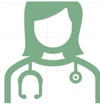
Medical Exams- Billable to specific payors